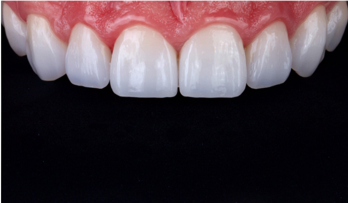
Fig. 13: The highly esthetic restoration results from VITABLOCS TriLuxe forte.

forte proved to be a genuine economical alternative to layering on refractory casts or platinum foils, which means that these kinds of cosmetic procedures can now be offered to an even wider range of patients.