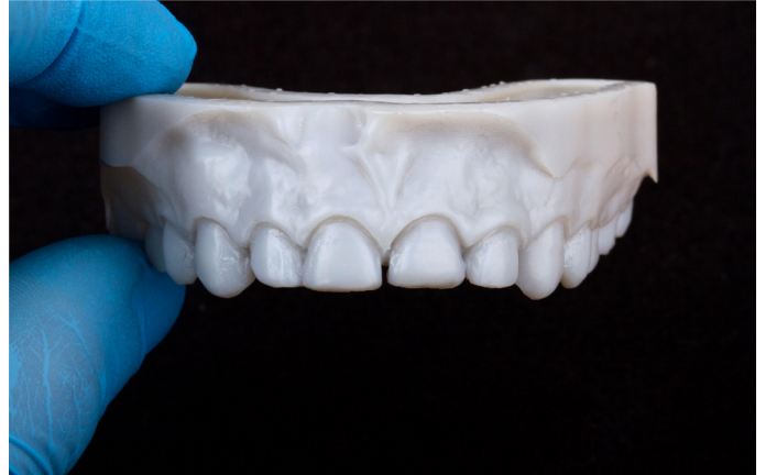
Fig. 8: Situation after guided preparation, intraoral scan and additive fabrication of a control model.