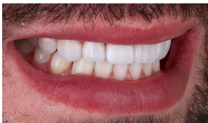
Lateral view of the bright, film-worthy smile.