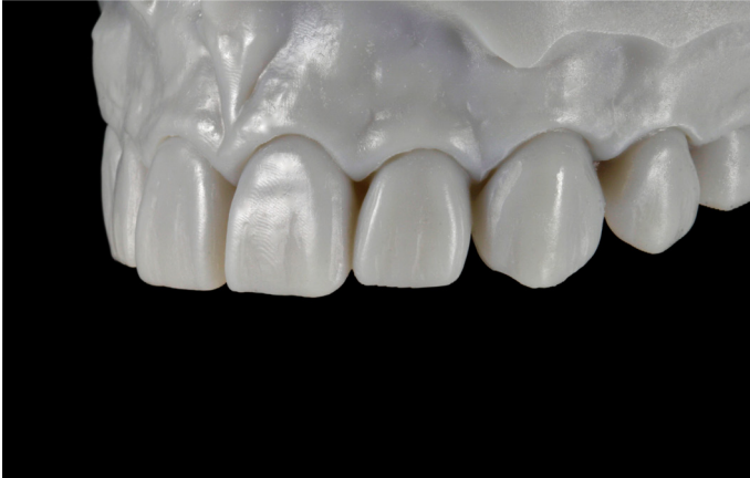
Fig. 7: A silicone key was fabricated on the mock-up to transfer the target situation intraorally using composite.