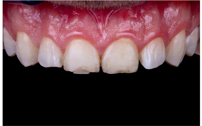
Fig. 2: Several attempts had already been made to build up the two central incisors with composite.