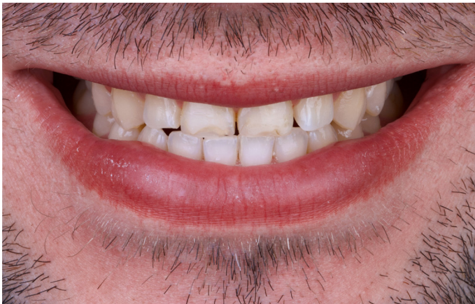
Fig. 3: Teeth 11 and 21 tended to be in end-to-end occlusion.