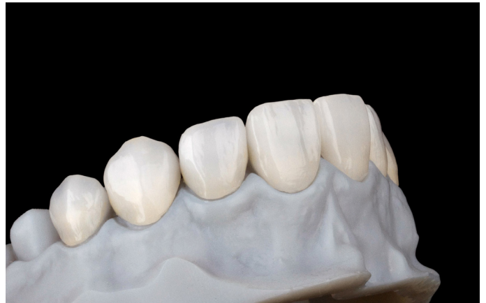
Fig. 10: The eight finished and polished feldspar ceramic veneers on the control model.