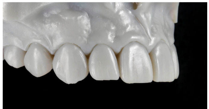
Fig. 6: Lateral view of the additive mock-up model.