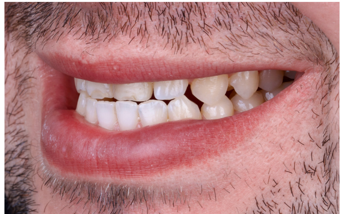
Fig. 4: The dynamic occlusion in protrusion in the lateral view.