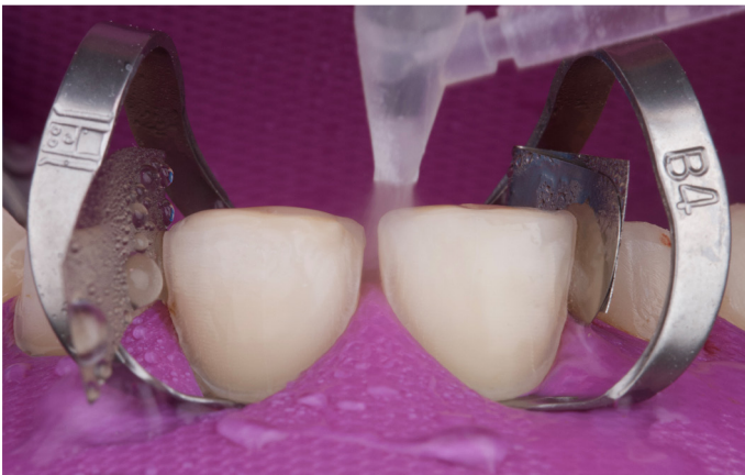
Fig. 11: After phosphoric acid etching, the prepared teeth 11 and 21 were rinsed with water.