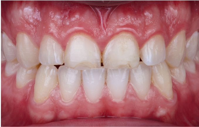
Fig. 1: Initial situation with the severely abraded teeth 11 and 21.

A 35-year-old patient was one of those people who wanted a bright, film-worthy smile. It became clear during the initial examination why he was not satisfied with his current situation. The central incisors of the esthetic zone tended to be in end-to-end occlusion, which is why significant abrasion and chipping were also visible. This had repeatedly been treated unsuccessfully with direct composite fillings.