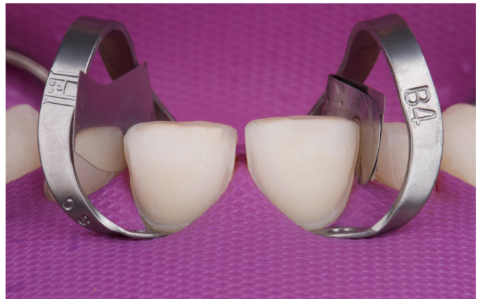
Fig. 12: The etched preparations before application of the adhesive.