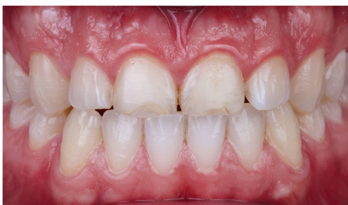
Initial situation with the severely abraded teeth 11 and 21.