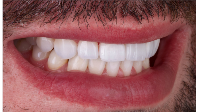
Fig. 14: Lateral view of the bright, film-worthy smile.